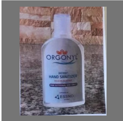
Orgonyl Brand Alcohol Based Hand Sanitizer